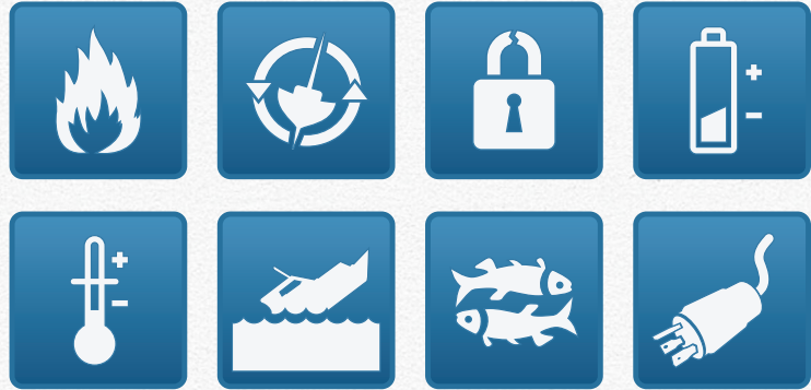
Transponder Monitoring Capabilities